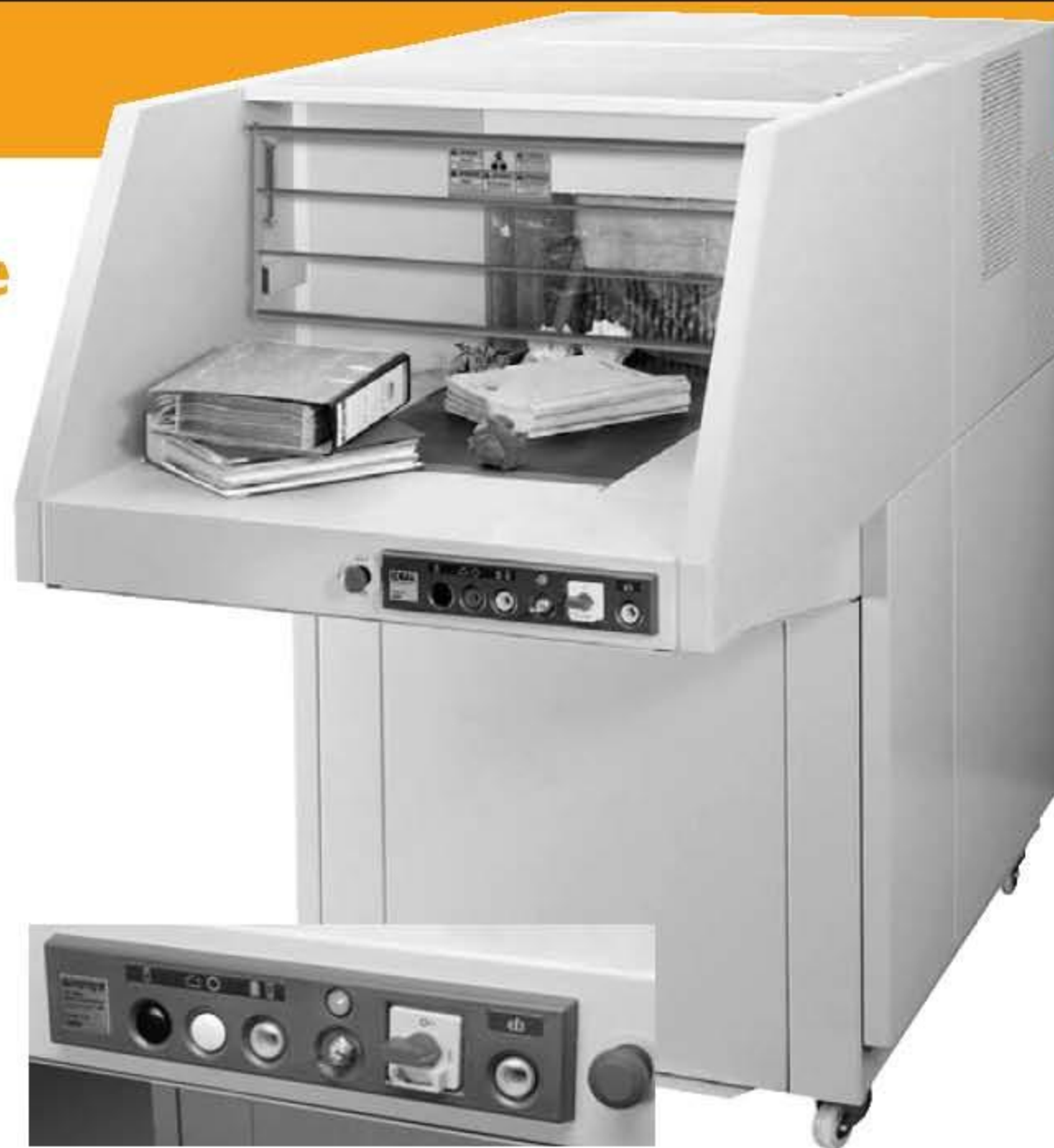
Easy to use control panel with optical indicators, push buttons for stand-by/stop/reverse and emergency stop button.

**Two shred speeds. Speed will decrease slightly in "Power" mode. Capacity will decrease slightly in "Speed" mode.